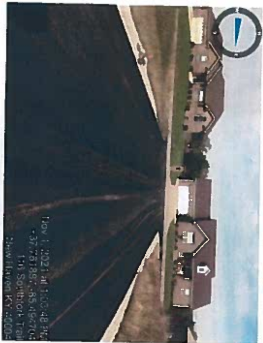
Delaney Lane—Off Southfork Trail