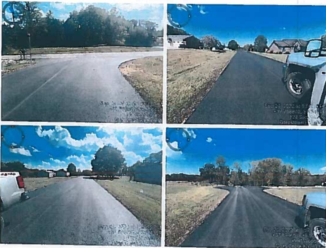
Wolf Woods Drive (Off Mobley Mill) Final Asphalt Surface Placement