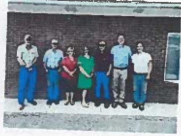
The District Board of Supervisors attend the KACD Annual Convention each year. They also attend the area meetings to keep abreast of legislation that affects the local district and to keep our landowners informed of law and policy changes.