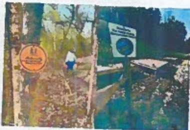
The Nelson County Conservation District has been sponsoring outdoor classrooms, since 1992. This year we are co-sponsoring a new outdoor classroom, named Naturally Discovered. We are really excited to be able to help them construct this classroom.